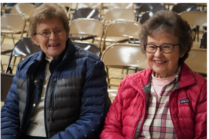
83rd ANNUAL MEETING